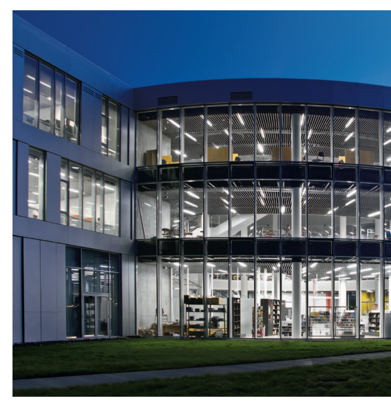
LIGHTLIFE 5 2010 REYKJAVIK UNIVERSITY