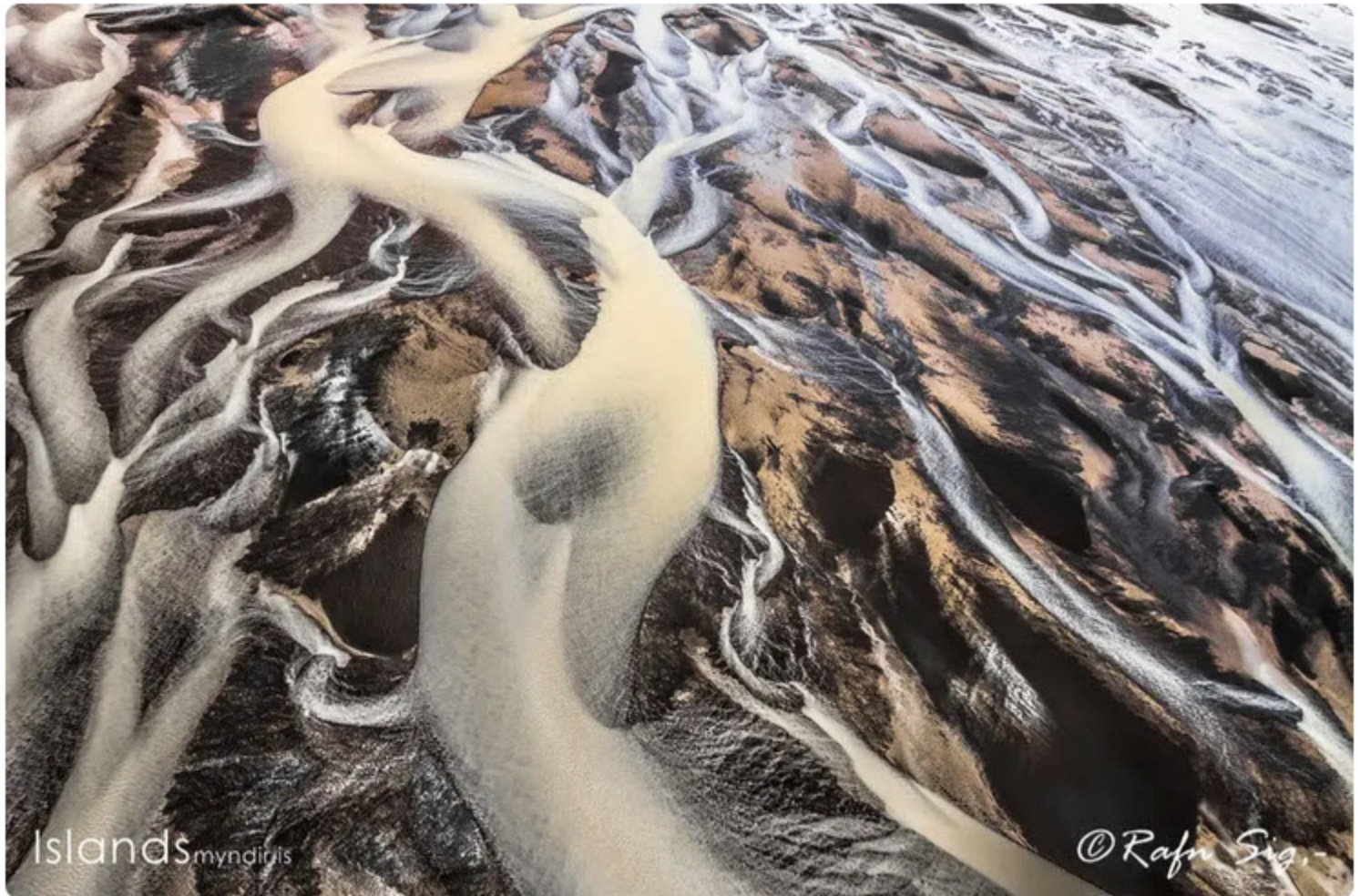
River Patterns in the Sand.

It started the day I took my first photo as I knew people would love the beauty of this country. In August 2014 I e-mailed my publisher with an idea of one book about Iceland and later that day he replied and said "No, let's make at least eight Iceland photo books, one for each part of Iceland, can you do that?" So from that day I have been collecting and processing my photos. I sent the last completed manuscript to the printers on the 26th of March. The first four books, "South, Southwest, Reykjavík and West" have been distributed all over Iceland and "Westfjords, North, East and Highlands" are being printed now and will be available in middle of April (2015).