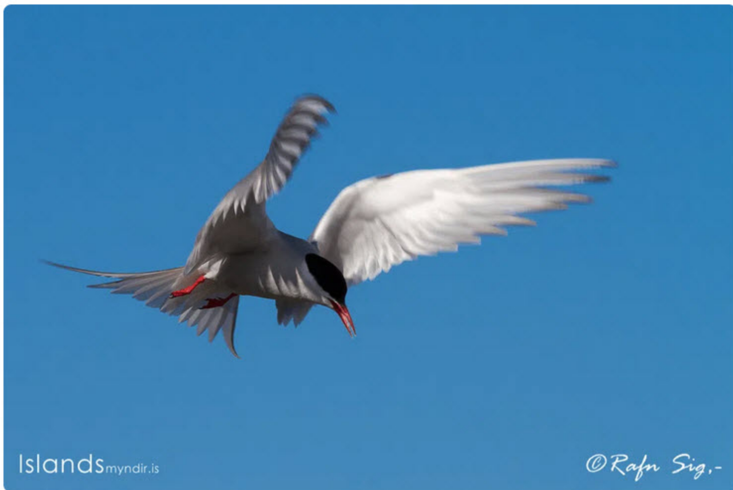
Arctic Tern on the offensive.

Actually Iceland is my favourite place. I have been traveled like a native all my life both in the highlands and the lowlands and I have found so many beautiful hidden spots along the way, I can't pick one out. It doesn't matter for me if I go to the same spot hundred times, it's always new experience for me as the time of year, light, time of the day and so on is different in every instance. I think I can answer your question like this, "the last spot I was shooting"